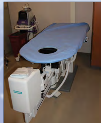
There are two ultrasound (left) four mammography (center) and two biopsy rooms (right) in the new clinic.