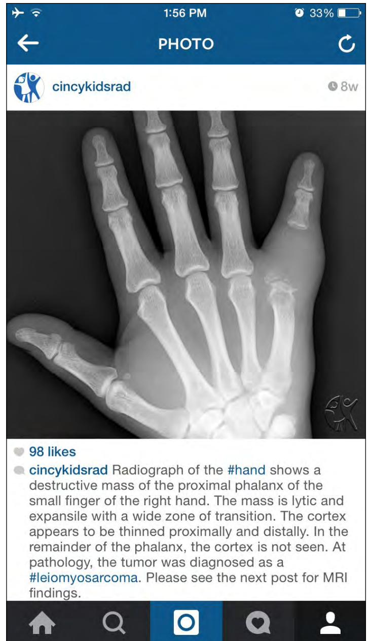
A sample post on Figure1.